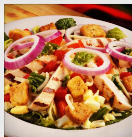
Grilled Chicken Salad