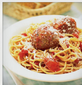
Italian Spaghetti & Meatballs