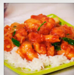
Mandarin Orange Chicken